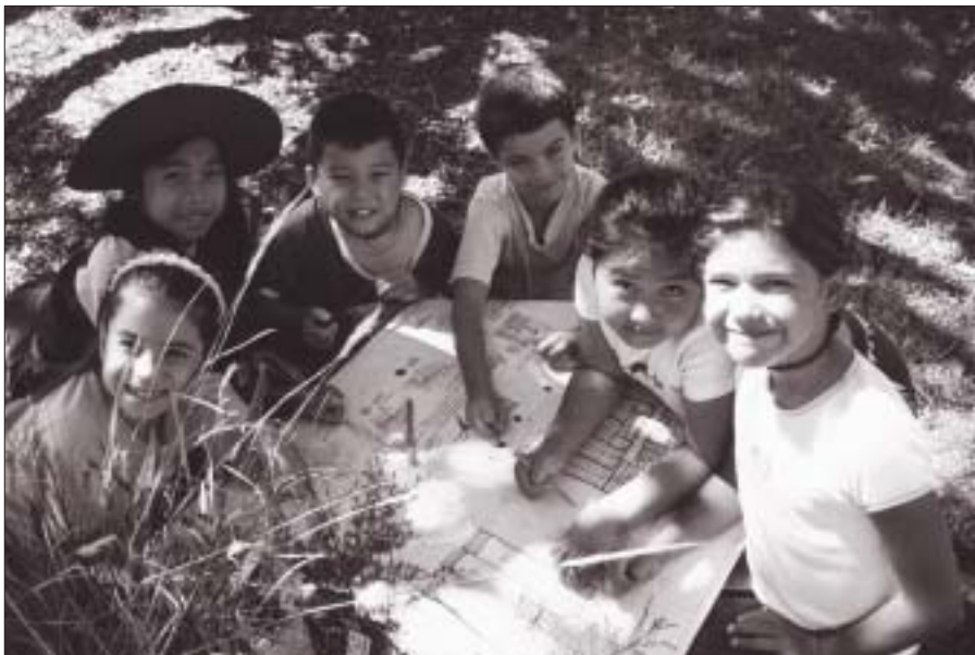
Children planning their new environmental school ground with help from Gould League.

It is envisaged that the grant from the Helen Macpherson Smith Trust will create a vision and plan for the schools involved in the program and inspire other schools to embark on similar journeys to develop their school grounds into exciting, rich learning environments.