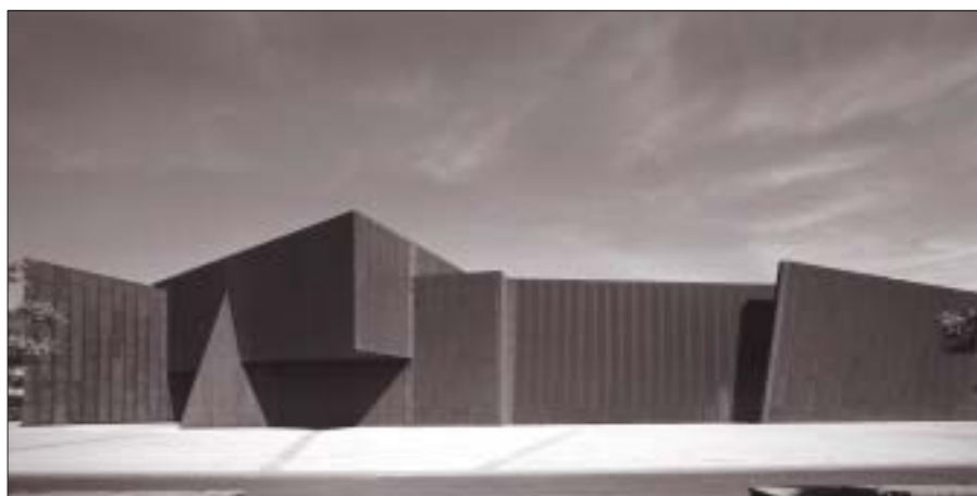
ACCA is a vital part of Melbourne's cultural landscape, and is located in the award winning, landmark rust-red structure in Sturt Street, Southbank.