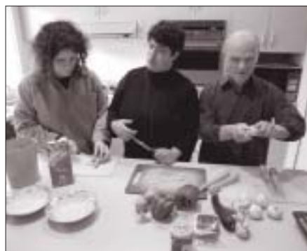
Disabled adults find esteem and independence through the Jewish Care Pilot Project.

This initiative was jointly funded by the Helen Macpherson Smith Trust and the Department of Human Services, with support from Sydney's Centre for Developmental Disabilities Studies and the Centre for Developmental Disability Health Victoria at Monash University.