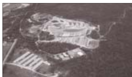
Initial development of the Royal Botanic Gardens Australian Garden at Cranbourne.