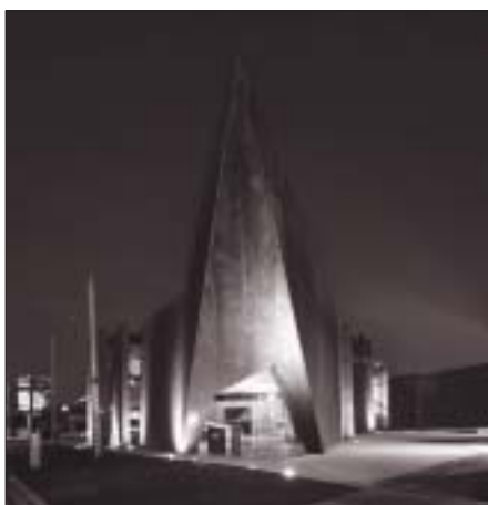
ACCA is Melbourne's premier contemporary art space presenting the most challenging, innovative and creative visual art of our time.

The first artist to receive the Helen Macpherson Smith Commission will be announced in early 2005, along with the inaugural regional gallery partnership.