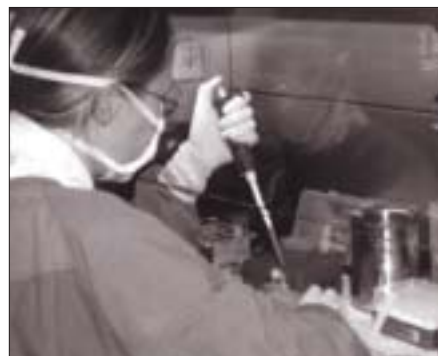
Scientist conducting important research into viral infectious diseases at Burnet Institute.

develop strategies to deal with future threats. The Burnet's PC3 facility is well placed, and equipped, to meet these challenges through the assistance of the Helen Macpherson Smith Trust in providing support for this laboratory facility.