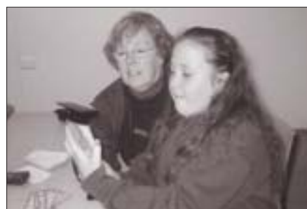
Volunteers acting as mentors for Victorian school children.