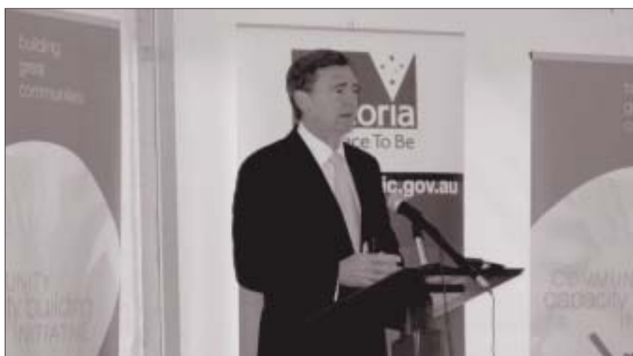
Hon John Brumby launches the Macpherson Smith Community Alliance.