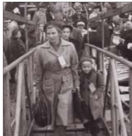
Boarding the Nelly at Bremerhafen, Germany, 1952.

The exhibition will pave the way for a national touring exhibition in 2006 highlighting the role of Australia's ports in the post-war migration experience, 'Destination Australia – Gateway to a New Life', which is being developed by Museum Victoria.