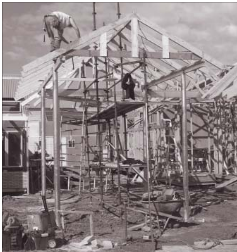
A special new high care facility for the homeless frail aged.