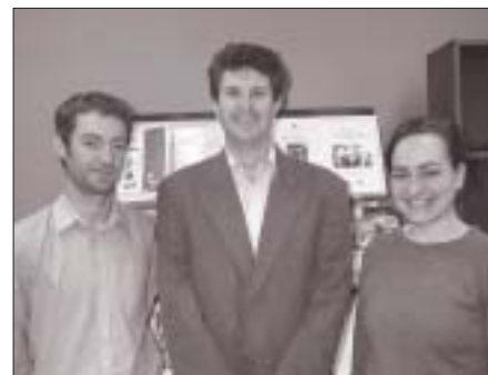
The Brotherhood evaluation team.

The Brotherhood of St Laurence believes that this project has the potential to make a significant contribution to understanding how support can be provided to the most disadvantaged job seekers. We also are very pleased to be working in partnership with the Brotherhood on such an important project.