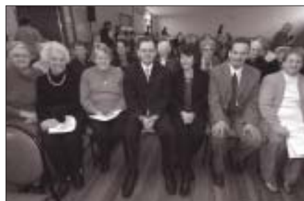
Professionals and volunteers combine to find new ways of supporting the elderly to stay at home.