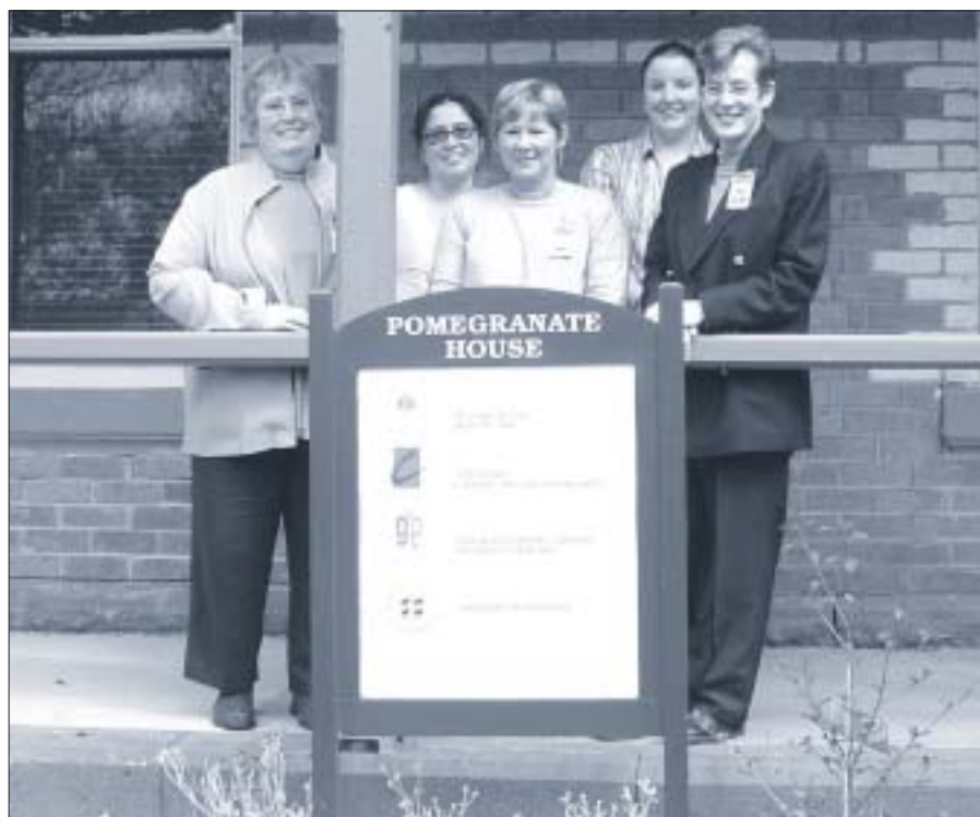
Staff and students at Pomegranate House.

The addition of a program dedicated to assessment and early intervention will enable Pomegranate House to better intervene with people displaying early signs and symptoms of mental health problems. The expected outcome is that this will help prevent the progression to a diagnosable disorder for those experiencing their first symptoms of mental health problems. For people who have already had first episodes of mental illness, being able to offer services early on when the first contact is made with an agency, could reduce the impact of mental illness and its duration.