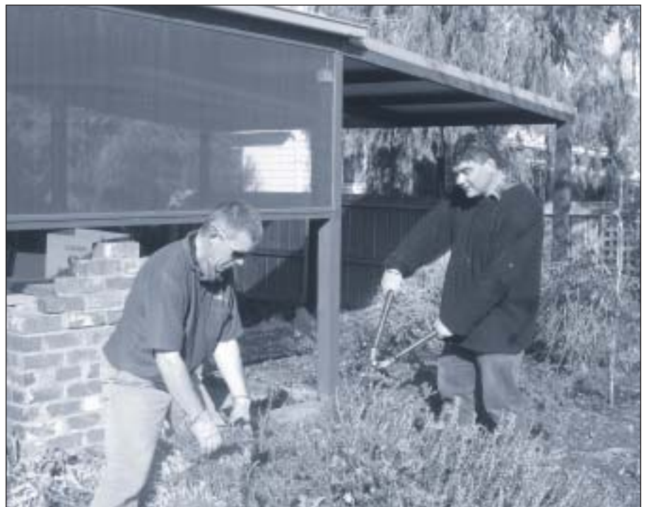
Members of the Overdrive Services crew, hard at work pruning, for an elderly resident in Horsham.

The publicity that the project has produced has enabled Community AXIS and Overdrive Services to increase our positive exposure within the community, which continues to attract more customers wanting to utilise the service. The success of the project has encouraged Community AXIS to seek alternative funding sources and has provided the opportunity to develop a sustainable pricing structure to warrant the future of the project.