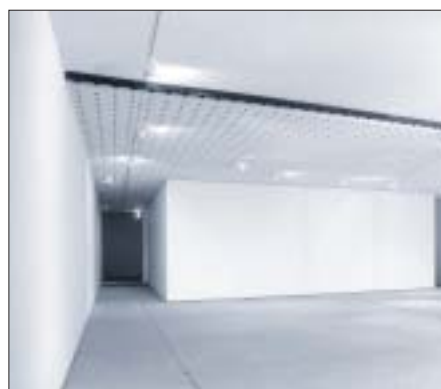
Centre for Contemporary Photography, Melbourne including Gallery Three.