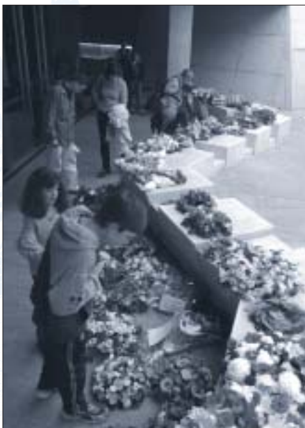
Victorian school children paying their respects at the Stone of Remembrance in the Sacred Sanctuary.

The Shrine looks forward to fostering further educational opportunities for Victorian school students in partnership with the Helen Macpherson Smith Trust, being a partnership based on our shared vision that Victorians have a duty to ensure the legacy of our veterans is passed on and embraced by future generations.