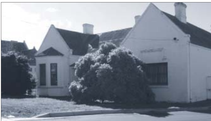
The 'Manse', built in the late 19th century will be restored and redeveloped to provide accommodation for training health professionals, and to accommodate families of hospital patients.

It is an exciting project for the Maryborough District Health Service where the assistance of its donors, including the Helen Macpherson Smith Trust, and its volunteers will transform a past treasure into an asset for future, locally provided, health services.