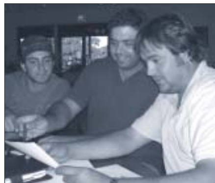
The Alliance brings a local community together to participate in rural projects.

The first grants round was held in September 2004 and the following allocations made: