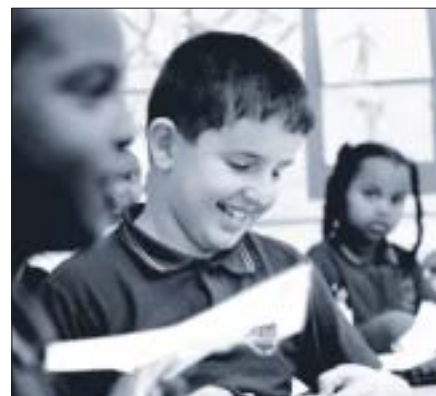
Refugee children in VFST classroom program.

A range of strategies exists for achieving a supportive environment for refugee students. One of the programs which is introduced to schools by VFST is the Kaleidoscope for the Classroom group work program, which has an aim of promoting student wellbeing and cultural diversity. This is conducted in classrooms where there is a mix of refugee and non-refugee students, and it encourages connection between group participants. Having participated in such a group, students commented "What made the group work well, was that everybody spoke and listened to each other to learn about each other. I liked to learn things about other people's cultures and beliefs. I felt like I had acceptance when people said what I did was interesting. I think people accept others more now and don't care about their cultural differences".