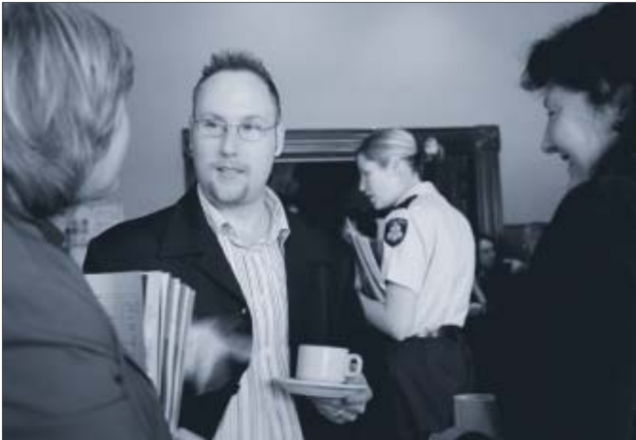
Networking between Darebin's health and safety council workers, partner organisations and local agencies.

The grant awarded by the Helen Macpherson Smith Trust will provide for a two year project that both formalises local agreements and protocols in regard to family violence in Darebin and to share our learnings about processes and outcomes of the partnership with other local governments, service providers and police in Victoria. Darebin will actively engage with other local governments to explore what has 'worked' and encourage similar partnerships led by local government in other municipal areas. This initiative has the potential to have local government bringing agencies together that will significantly improve the ability to respond to family violence in Victoria.