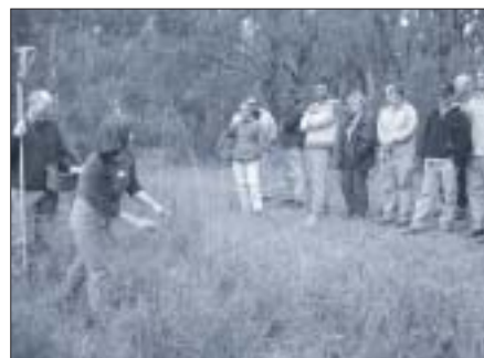
Seed collection training.

The joint funding of this course by the Helen Macpherson Smith Trust and The William Buckland Foundation will develop participant understanding of production systems in relation to indigenous ecosystems and management (management skills). Interactions with the local ecosystem will be better understood and participants will be able to manipulate systems (vegetation, soils, water, climate) in order to achieve worthwhile management outcomes.