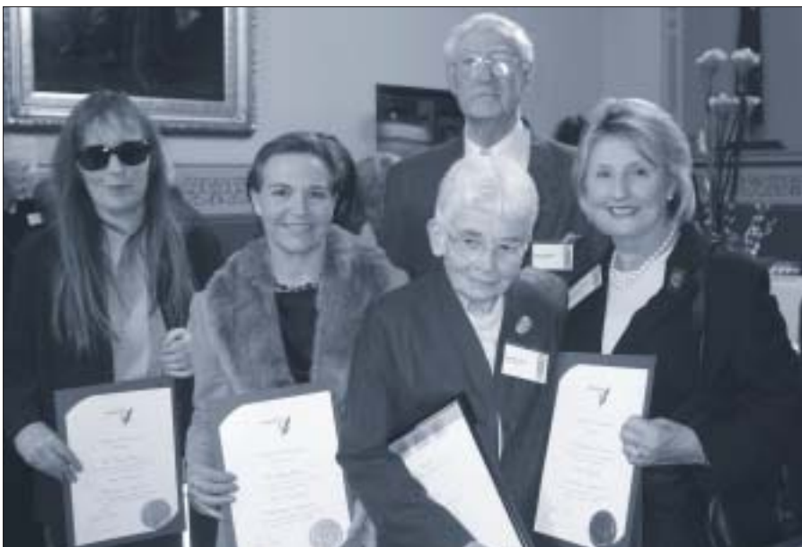
Court Networkers at the Court Network 25th Anniversary Celebrations at Government House, Melbourne in June this year.

The completion of this regional expansion project will allow communities in four new locations in regional Victoria to benefit from the Court Network service in their local courts. This support will be ongoing and sustainable.