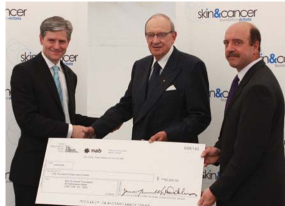
Launching the new Skin and Cancer Foundation premises, 12 Nov 2008